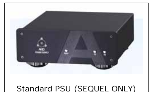
Standard PSU (SEQUEL ONLY)